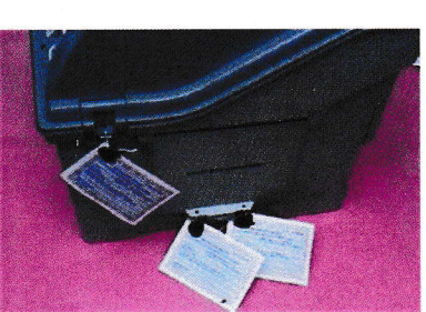
Sealing of Drop Box of VVPAT with Address Tag

2. Seal the drop box of VVPAT with Address Tag and ask polling agents also to sign it.